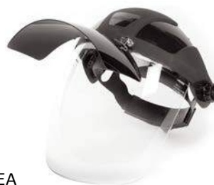
Multi-Purpose Face Shield with Flip-Up IR Window and Ratcheting Headgear