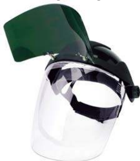
Multi-Purpose Face Shield with Flip-Up IR Window and Ratcheting Headgear