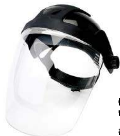
Standard Face Shield with Ratcheting Headgear

All Sellstrom face shields are CUL tested and certified to CAN/CSA Z94.3 standards.