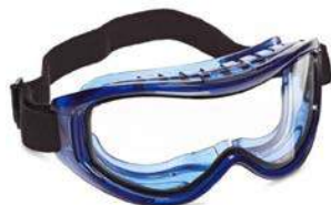
Odyssey II Series Industrial Dual Lens Goggle