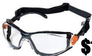
XPS502 Sealed Safety Glasses