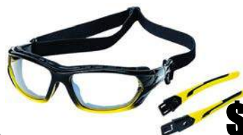
XPS530 Sealed Safety Glasses