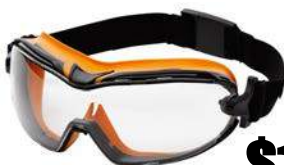
GM500 Series Safety Goggle